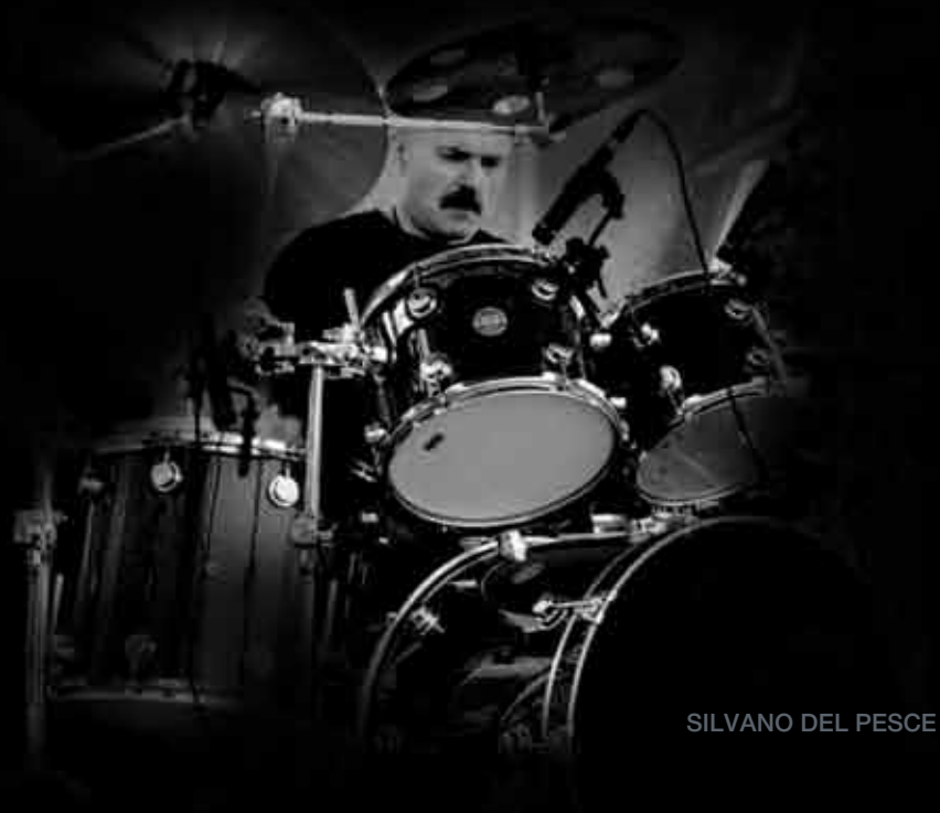
SILVANO DEL PESCE

The Sumelas have an unconventional finish & a unique sound. There is a central band about 1 ½ “wide and 2” in from the outer edge of the cymbal that is polished, though not brilliant. A similar, smaller band surrounds the bell. The rest of the top is lathed, but also “acid-washed,” which gives it a slightly rough, dry texture. The entire bottom of the cymbal is acid-washed, as well. This technique flattens the over-tones a bit. It also increases the propensity of the cymbal to tarnish, which gives our Sumelas a beautiful “vintage” green patina.