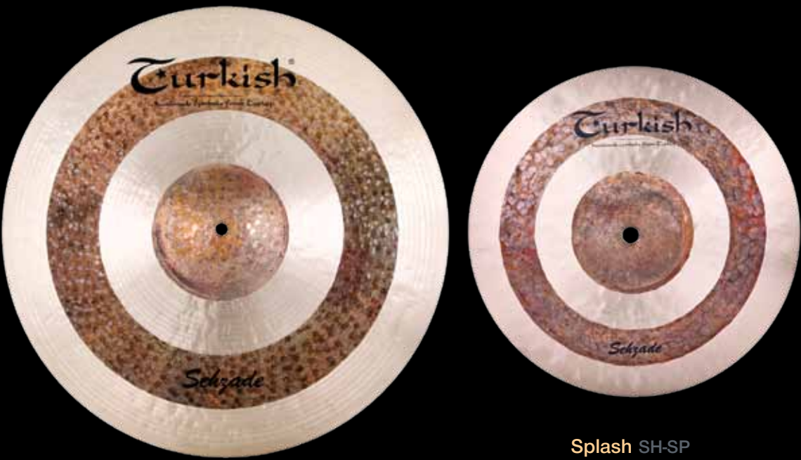
Ride Ride SH-R Ride Jazz SH-RJ

Splash Quick & direct responses with a clear attack.