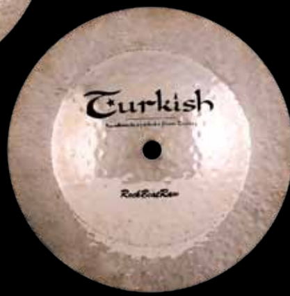
Big Bell RBR-BBL