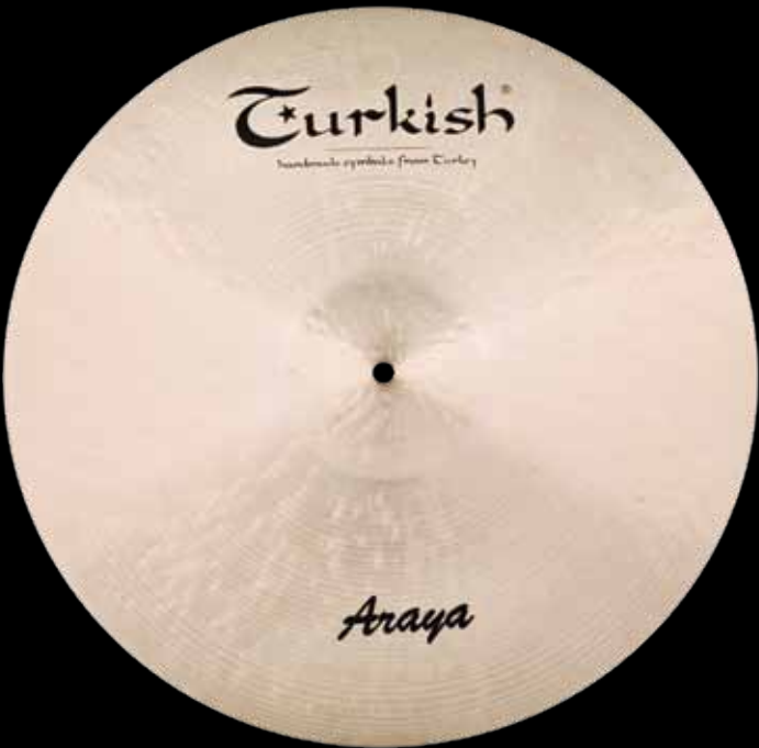
Ride Ride A-R Ride Flat A-RF

Crash Sensitive, explosive sounds with fast response. Highly musical cymbals.