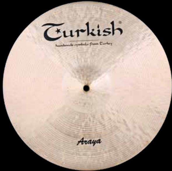
Hi-Hats Hi-Hat A-H Hi-Hat Flat Hole A-HFH