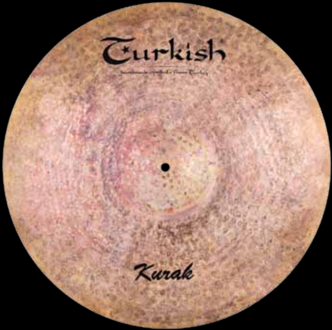
Ride Ride K-R Ride Flat K-RF

China Ear-piercing, “trashy cymbal sound.” Exotic&complex.